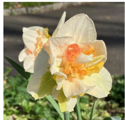
3 varieties of my daffodils