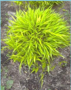
Japanese forest grass