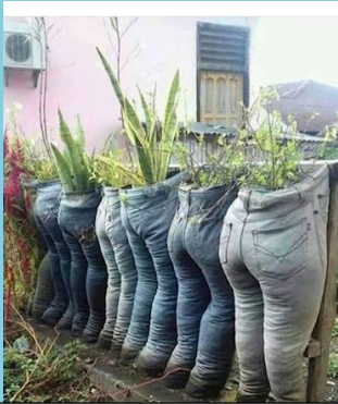
apartmentharvest- I'm all for upcycling, but this is.....