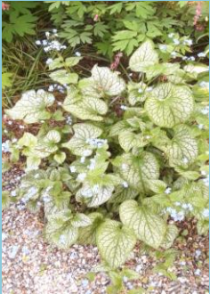
Brunera – ( forget-me-nots)