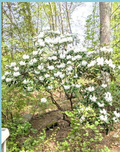
Yaku Princess Rhododendron

Rhododendron yakushimanum is named for its native Yakushima Island, Japan. It is a dense, mounding, evergreen rhododendron, hardy from -5 to -15 degrees F. Leaves are dark green on top, with a thick brown wool on the undersides, from 3 to 5 1/2 inches long. Flowers are borne in trusses of 5 to 10 blooms in mid to late spring.